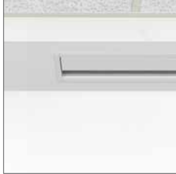
In Ceiling (Closed)