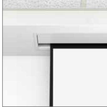
In Ceiling (Open)