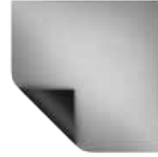
Silver Lite 2.5