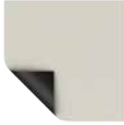
High Contrast Matte White