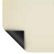
Video Spectra 1.5