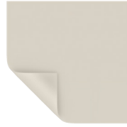
Ultra Wide Angle