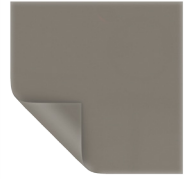
High Contrast Da-Tex