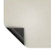
High Contrast Cinema Vision Half Angle: 50° Gain: 1.1