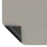
High Contrast Da-Mat Half Angle: 45° Gain: 0.8