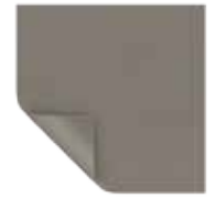
Da-Tex Half Angle: 30° Gain: 1.3