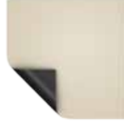
Cinema Vision Half Angle: 45° Gain: 1.3