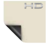
HD Progressive 1.1 Perf Half Angle: 85° Gain: 1.1