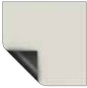
Audio Vision Half Angle: 60° Gain: 1.0