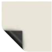
Da-Mat Half Angle: 60° Gain: 1.0