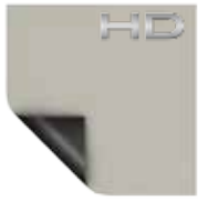
HD Progressive 0.6 Half Angle: 85° Gain: 0.6