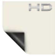
HD Progressive 0.9 Half Angle: 85° Gain: 0.9