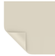
Dual Vision Half Angle: 65° Gain: 0.9