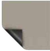
High Contrast Audio Vision Half Angle: 45° Gain: 0.8