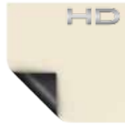
HD Progressive 1.1 Half Angle: 85° Gain: 1.1