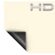
HD Progressive 1.3 Half Angle: 75° Gain: 1.3