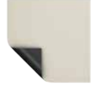
Pearlescent Half Angle: 40° Gain: 1.5