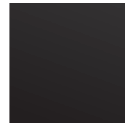
Features lens-like, micro-layered surface to achieve optimal ambient light rejection