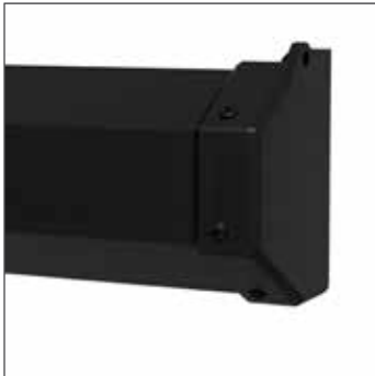
Black Case (Standard)