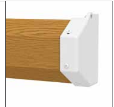
Light Veneer Case