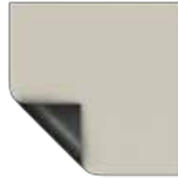
High Contrast Cinema Perf