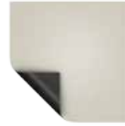
High Contrast Cinema Vision