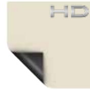
HD Progressive 1.1 Perf