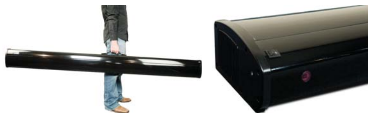
Durable aluminum black case with piano gloss finish