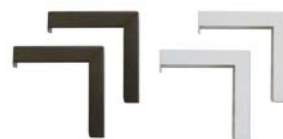
ZVMAXLB6-B: Black 6" L Bracket Set ZVMAXLB6-W: White 6" L Bracket Set