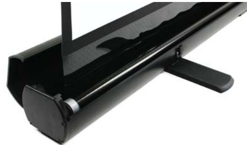
Details of the telescope bracket hook support and variable height setting