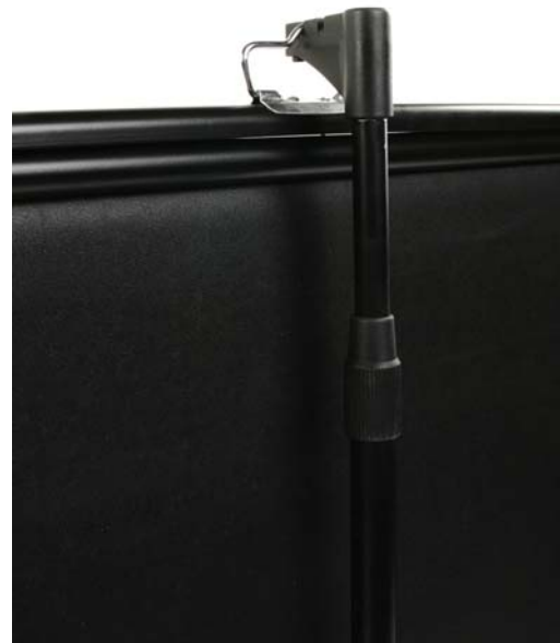
Self-contained light weight Aluminum Casing with telescoping bar and travel case allows this screen to be easily transported, set up and taken down.

ezCinema Series, Screens pull up from case and attach to an adjustable telescoping bar with variable height settings with a keystone adjuster. Solid rotating floor supports provide added stability.